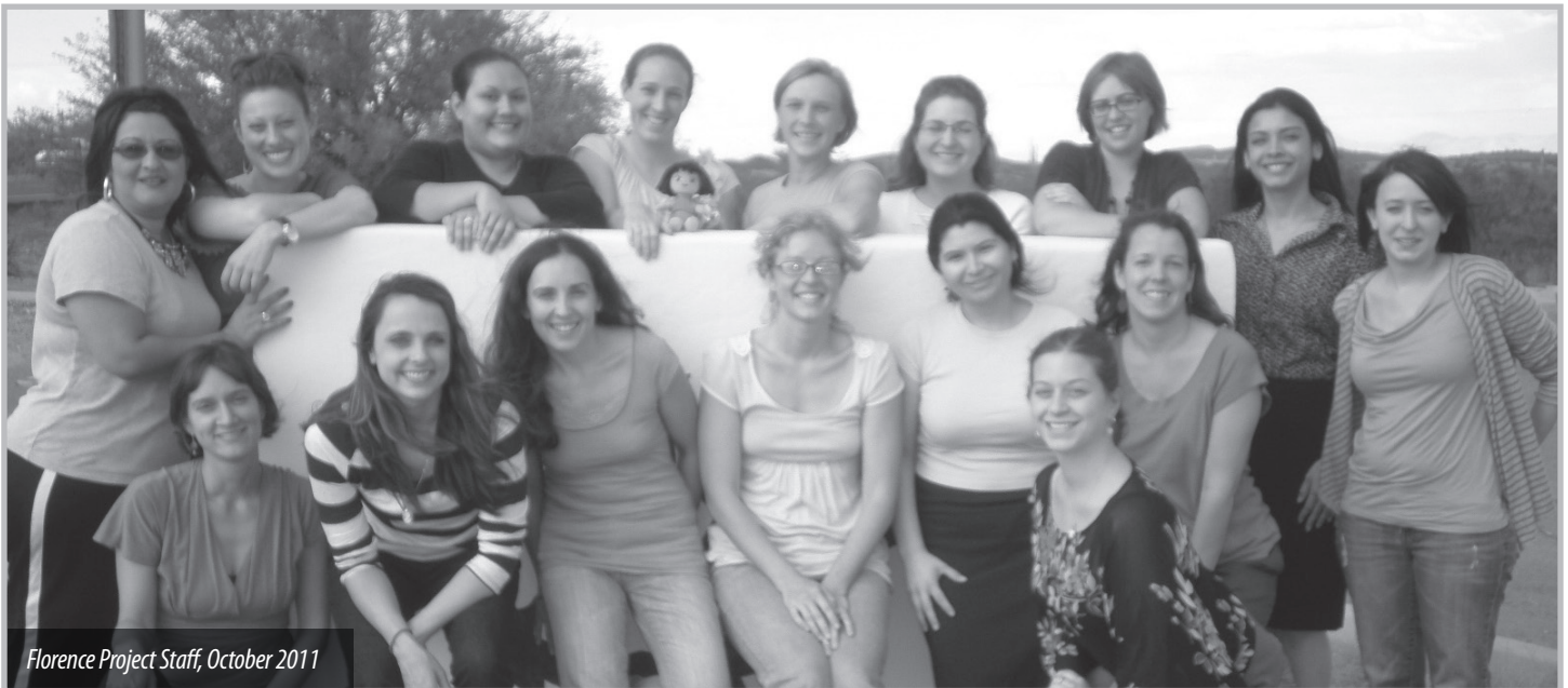
Florence Project Staff, October 2011