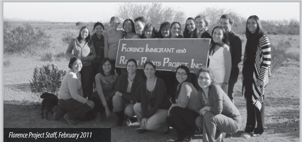
Florence Project Staff, February 2011