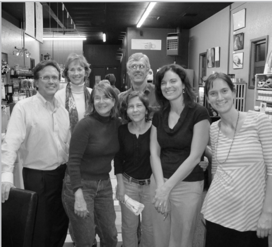
Florence Project Board Members and Supporters at a November outreach event in Flagstaff.